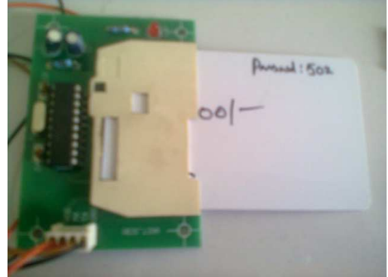
Figure 3: SMART CARD

The smart card is used for the purpose of deducing the exact amount from the vehicle owner who frequently passes from the tollgate. The smart card is same as the ubiquitous bank card with its magnetic stripe that is used as the payment instrument for numerous financial schemes. Integrated Circuit Cards come in two forms, contact and contactless. In this project we are using contact smart card. The Contact Card is the most commonly seen ICC to date largely because of its use in France and now other parts of Europe as a telephone prepayment card.