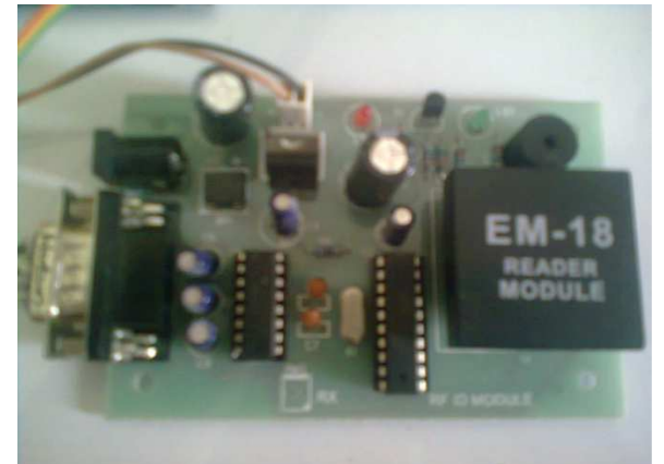
Figure.2 RFID READER

A typical RFID system. In every RFID system the transponder Tags contain information. This information can be as little as a single binary bit, or be a large array of bits representing such things as an identity code, personal medical information, or literally any type of information that can be stored in digital binary format, that communicates with a passive Tag. Passive tags have no power source of their own and instead derive power from the incident electromagnetic field. Commonly the heart of each tag is a microchip. When the Tag enters the generated RF field it is able to draw enough power from the field to access its internal memory and transmit its stored information. When the transponder Tag draws power in this way the resultant interaction of the RF fields causes the voltage at the transceiver antenna to drop in value. This effect is utilized by the Tag to communicate its information to the reader. The Tag is able to control the amount of power drawn from the field and by doing so it can modulate the voltage sensed at the Transceiver according to the bit pattern it wishes to transmit.