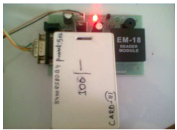
Figure5: RFID READER & RFID TAG

Step9: This process should be done one by one, by using RFID and the Smart card.